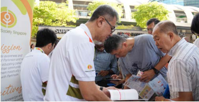
PSS engaging with members of the public