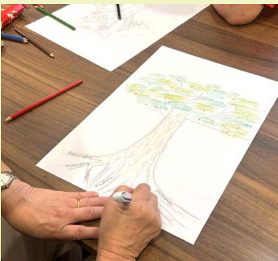
A participant creating their "Tree of Life"