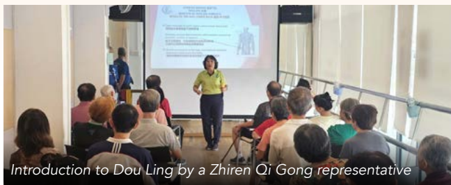
Introduction to Dou Ling by a Zhiren Qi Gong representative

Parkinson Warriors (PWs) and caregivers experienced an afternoon of learning and connection on 30 March 2026, as they engaged with the Zhiren Qi Gong group at the Parkinson Society Singapore (PSS) Bishan Centre. The session opened with a short performance by our Daiko drummers and PWs, which set a lively tone for the afternoon.