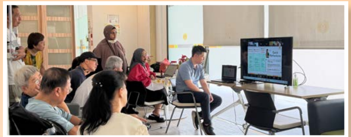
Participants listening and taking part in the PSS Huddle in person and over Zoom

The first session, held on 12 March 2026, kicked off with the topic "Demystifying Parkinson". Members joined both virtually and at the centre to share their experiences and tips for symptom management. The following session on 7 April 2026 focused on "Self-