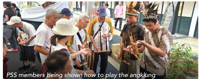
PSS members being shown how to play the angklung

Altogether, the visit was an enriching experience that allowed members to learn about and engage with Malay heritage in an interactive setting.