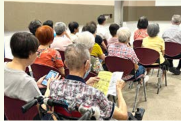
A participant referring to a Parkinson awareness pamphlet provided during the session

Drawing on Erikson's theory of psychosocial development, the discussion further explored the stage of later adulthood, in which individuals aged 65 and above face the stage of "integrity versus despair". At this stage, maintaining a sense of wisdom becomes especially meaningful, as opposed to feeling regret over missed opportunities. Many participants shared how their lived experiences position them to guide younger generations, while also advocating for greater understanding of Parkinson within their communities.