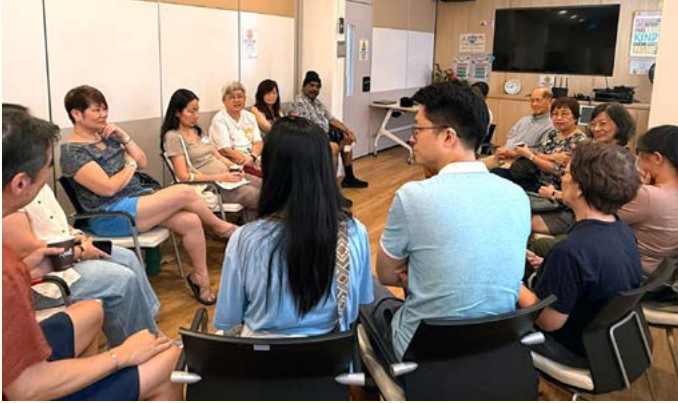
Participants discussing caregiving experiences, challenges, and coping strategies