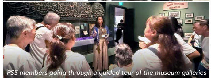
PSS members going through a guided tour of the museum galleries