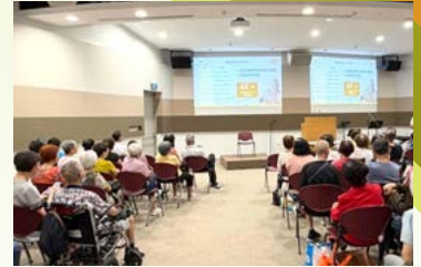
PSS sharing on life stages, prompting conversations on how awareness of Parkinson varies across generations

The session was marked by thoughtful reflections and a shared openness to learn from one another. It also highlighted the importance of intergenerational dialogue in building empathy and awareness around Parkinson. We look forward to more meaningful conversations that strengthen connections across communities, as we continue to advocate for Parkinson!